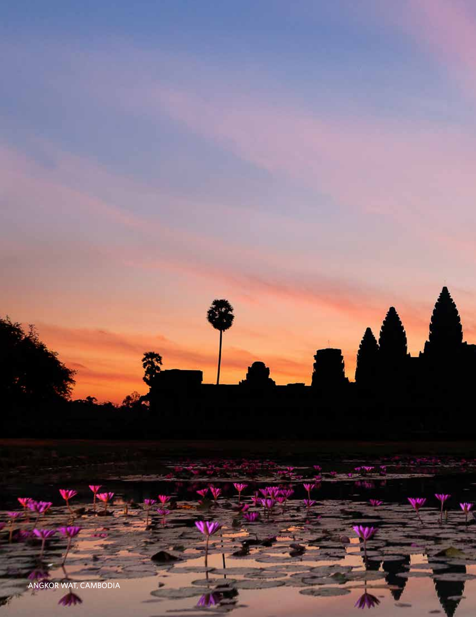
ANGKOR WAT, CAMBODIA